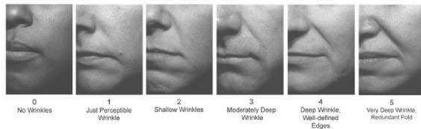
FIGURE 1 WRINKLE ASSESSMENT SCALE (WAS)

SCULPTRA may provide cosmetic correction of fine lines and wrinkles in the cheek region in patients that have many superficial lines or a few shallow wrinkles to many shallow wrinkles of a few moderate depth wrinkles in the cheek region.